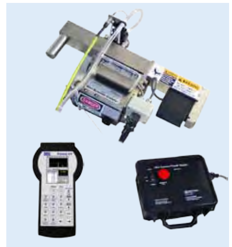
Pocket UT™ system not included; may be purchased separately.

For more information on the MINI Scanner or the Pocket UT™, please call 1-609-716-4000 or visit us on the web at www.mistrasgroup.com